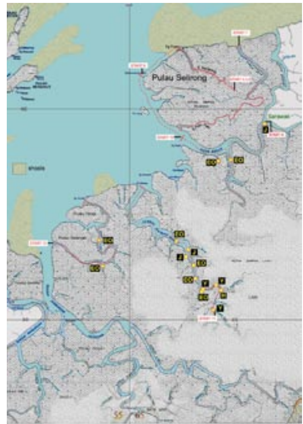
Figure 1. Southeastern coast and interior of Brunei Bay, Brunei Darussalam. Night count routes (dotted lines) and crocodiles sighted (dots and age class code) are included for rivers/tributaries surveyed north of the partly depicted Temborong River system. Survey numbers refer to location sequence in Table 1 in Cox (2006).

Fauna and flora surveys undertaken in 2000 and 2001 in the Pulau Selirong Forest Recreation Park (PSFRP) documented the occurrence of the Saltwater crocodile ( Crocodylus porosus ) (Charles 2002). On 23-29 May and 8-19 July 2006 systematic surveys of crocodiles were undertaken by Jack Cox and Forestry Department personnel, in PSFRP and other areas of Brunei Bay, northeastern Brunei Darussalam (Cox 2006) (Fig. 1).