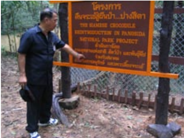
Figure 1. Project sign in restricted area of Pang Sida National Park.

unsuitable for a crocodile population and there is a plan to relocate this individual. Phu Kieow Wildlife Sanctuary is situated in central Thailand and surveys found a remnant population up in the water shed. There is still a question as to whether the record of C. siamensis at high altitude (750 m above sea level) in Khao Yai NP involves a released animal or a new population.