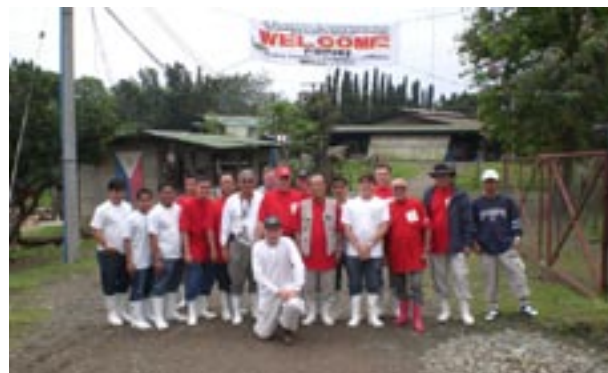
Figure 1. Participants of field trip to J.K.Mercado & Sons Agricultural Enterprises. The Forum on Crocodiles in the Philippines attracted international participants from Australia, USA, Papua New Guinea, Japan, France, Cambodia, Malaysia, Hong Kong, Thailand, Norway, Indonesia and the Netherlands.