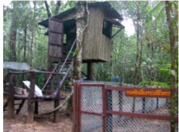
Figure 2. Temporary enclosure in the study area for acclimatization of crocodiles prior to release.

The training for wildlife rangers was completed in mid-2004, and included natural history of crocodiles, importance of crocodiles in the ecosystem, safe handling techniques for all-sized crocodiles, survey techniques and field data collection.