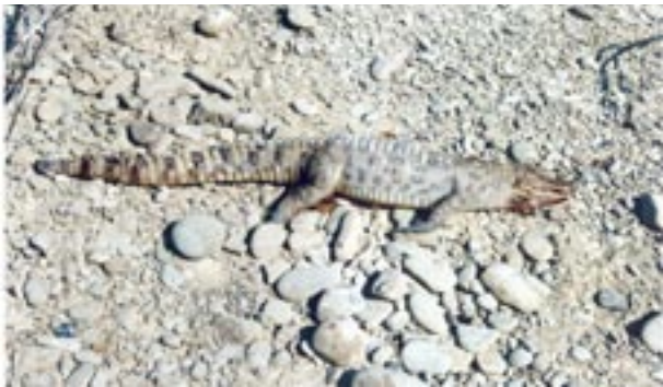
Figure 1. Juvenile Mugger crocodile killed by car strike.

Where crocodiles cross roads with no lighting, car strike is a potentially serious threat to the animals (Fig. 1). With such cases the final destination of the crocodiles was unclear, and due to the large areas involved, control measures and monitoring are impossible. Due to high speeds and numbers of cars, especially trucks, prevention of accidents with animals such as crocodiles would also seem impossible. Over the past three years, 5 strikes causing the death of the crocodiles were recorded. The average length of these juvenile crocodiles was 132 cm.