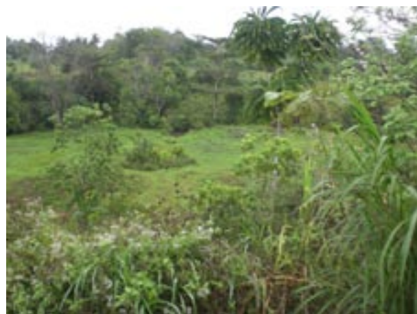
Figure 2. J.K. Mercado marsh land, a potential release site for C. mindorensis in Mindanao.

Many of these sites appear ideal for the release of C. mindorensis into the wild, and the Mercado family are to be congratulated for acquiring suitable habitat at their own expense (Fig. 2), specifically to contribute to conservation of the critically endangered, endemic crocodile.