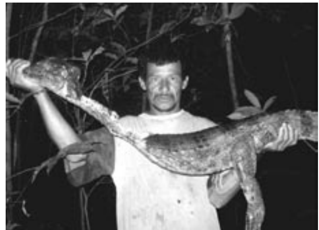
Figure 1. Female C. crocodilus predated by jaguar as it was guarding its nest.

Females were found in the vicinity of 36 (48.6%) of the C. crocodilus nests, hidden under tree roots, fallen trees or leaves. Estimated size of these females ranged from 45 to 80 cm SVL. Eleven nests were opened and clutch size varied between 2 and 35 eggs (mean clutch size= 24.9; mean egg length= 6.18 cm, SD= 0.51; mean egg width= 3.84 cm, SD= 0.22; mean egg weight= 53.71 g, SD= 8.56). Most nests contained eggs (73.0%), 17.6% had already hatched and 9.4% were predated. Local people were responsible for 57 % of predated nests, and the remainder were probably predated by Brown capuchin monkeys ( Cebus apella ), lizards ( Tupinambis teguixim ) or jaguar ( Panthera onca ). Predation by jaguar was registered once, eating only 4 eggs and also killing and consuming part of the female guarding the nest (Fig. 1).