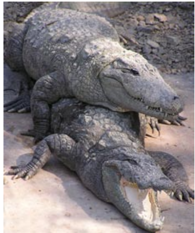
Figure 1. Two wild Mugger crocodiles attempting to mate on land.

Charlie Manolis, CSG Regional Chairman for Australia and Oceania , < cmanolis@wmi.com.au >.