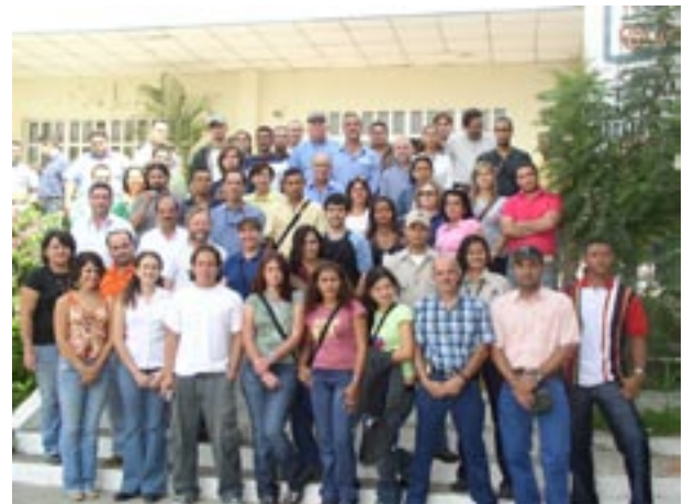
Figure 1. Participants at Workshop on the Conservation of the Orinoco Crocodile.

the Ministry of the Environment (MINAMB).