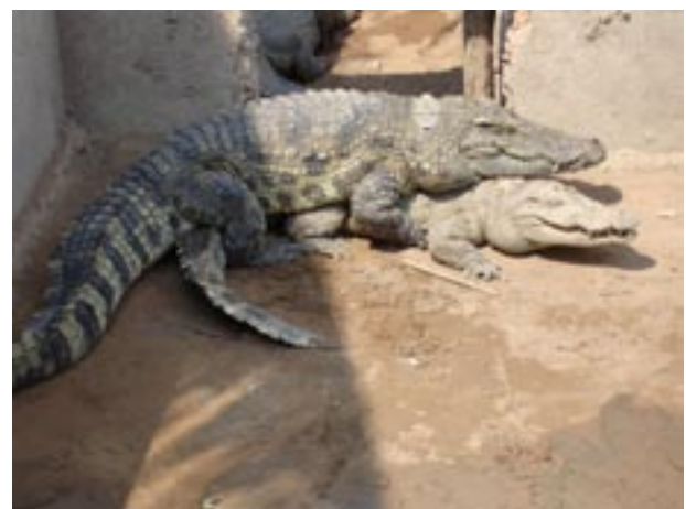
Figure 2. Two captive Siamese crocodiles attempting to mate on land.

EDITORIAL POLICY: All news on crocodylian conservation, research, management, captive propagation, trade, laws and regulations is welcome. Photographs and other graphic materials are particularly welcome. Information is usually published, as submitted, over the author's name and mailing address. The editors also extract material from correspondence or other sources and these items are attributed to the source. If inaccuracies do appear, please call them to the attention of the editors so that corrections can be published in later issues. The opinions expressed herein are those of the individuals identified and are not the opinions of CSG, the SSC or the IUCN-World Conservation Union unless so indicated.