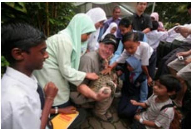
Figure 1. Dr. Brady Barr provides hands-on encounter with a crocodile for school children at Zoo Negara, Malaysia.

ASIAN CROC CONSERVATION AND EDUCATIONAL INITIATIVE. In August 2006, National Geographic Channels International (NGCI) funded a 6 country tour to promote crocodile conservation and education. The 1-month tour involved educational lectures at zoological facilities, museums, and universities, for local school children (Fig. 1). The series of lectures reached over 5000 students across the 6 target countries, and was covered by over 100 media interviews. Dr. Brady Barr, National Geographic's resident herpetologist and former US public school educator, conducted the informative lectures for the children, and in conjunction with local zoos provided hands-on encounters with representatives of Asia's crocodilians.